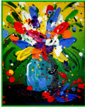
Flowers Acrylic on Canvas 25x20