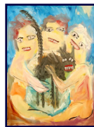
Bathing the Cat