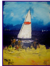
Boats Acrylic on Canvas 25x20