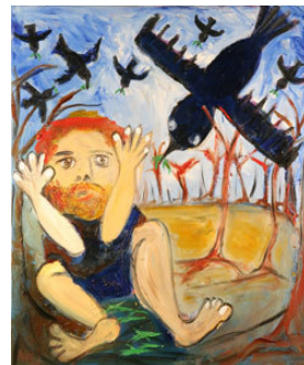
Elijah fed by Ravens