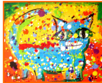
Cat Acrylic on Canvas 20x25