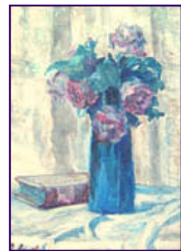
Grace Cossington Smith Still Life

She is known as an artist who chronicled urban life. After the death of her father in 1938, she moved her studio indoors and her beautiful series of intimate interiors began. Cossington Smith was a brilliant colorist and painter of light. Her works glow with a lumi-